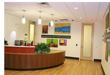
Deerfield Child and Family Health Clinic

Update: In 2014, Deerfield granted $425,000 to the Deerfield Child and Family Health Clinic. One in five visits at the Deerfield Clinic is by an uninsured patient, who is often undocumented and therefore ineligible for Medicare coverage. The grant covered the funding gap at the Deerfield Clinic, allowing it to continuously enhance the services and health care access for homeless children. The clinic was expected to provide at least 8,800 health care visits by the end of 2014; an 11% increase over 2013.