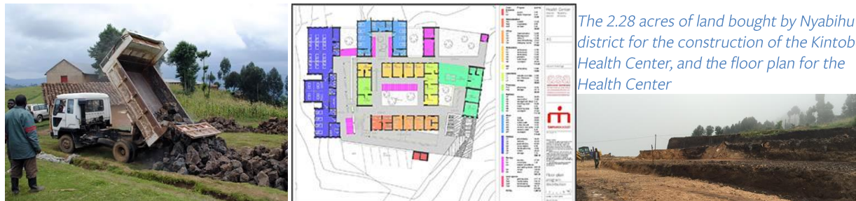
The 2.28 acres of land bought by Nyabihu district for the construction of the Kintobo Health Center, and the floor plan for the Health Center