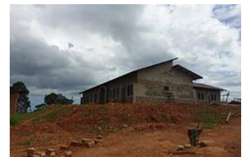
NSAMBE, MALAWI - FEBRUARY 10, 2015: Construction under way at the Dambe Health Center in Nsambe, Malawi.