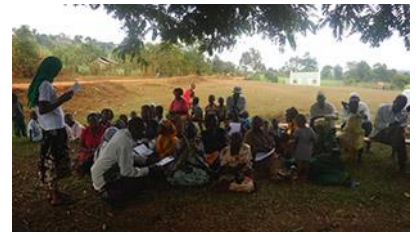
Local villagers attend malnutrition outreach

Update: As a result of the second year of investing in the malnutrition and outreach program, Soft Power Health expanded the outreach into 44 communities in the sub-county where Soft Power Health is located and the neighboring subcounty. Coupled with the educational outreaches for the communities, its expanded organic garden and gardeners have helped many families in need start their own productive organic gardens. This year alone, it has helped 25 families start their own gardens. This is a life-saving intervention.