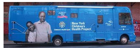
Deerfield Mobile Health Clinic

Mission: CHF is committed to providing health care to the nation’s most medically underserved children through the development and support of innovative, comprehensive primary care programs, reducing the impact of public health crises on vulnerable children, and promoting the health and well-being of all children.