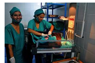
First C-section baby