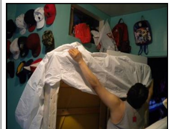
Home of child with asthma & bed bug infestation. Father was trained by LSA staff on how to control bed bugs without using ineffective and harmful pesticides

work to advocate for families in such situations and help them write letters to the appropriate authorities to have the root causes of the issues addressed. In the meantime, LSA Community Health Workers alleviate the affects of the mold with air cleansers, vacuums and air filters, by containing the affected areas, and by providing parent education.